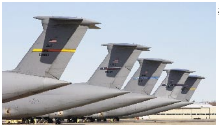
Active duty, Guard, and Reserve C-5As line up at Stewart Air National Guard Base in New York.

Youngstown-Warren Arpt./ARS, Ohio 44473-5912; 14 mi. N of Youngstown. Phone: 330-609-1364; DSN 346-1364. Units: 910th Airlift Wing (AFRC); Army Corps of Engineers; Army, Navy, and Marine Corps Reserve units; FAA. History: activated 1953. Area: 230 acres. Runways: three, primary length 9,000 ft. Altitude: 1,196 ft. Full-time personnel: AFRC, 451; ANG, 17. Lodging: 142 beds. Limited exchange.