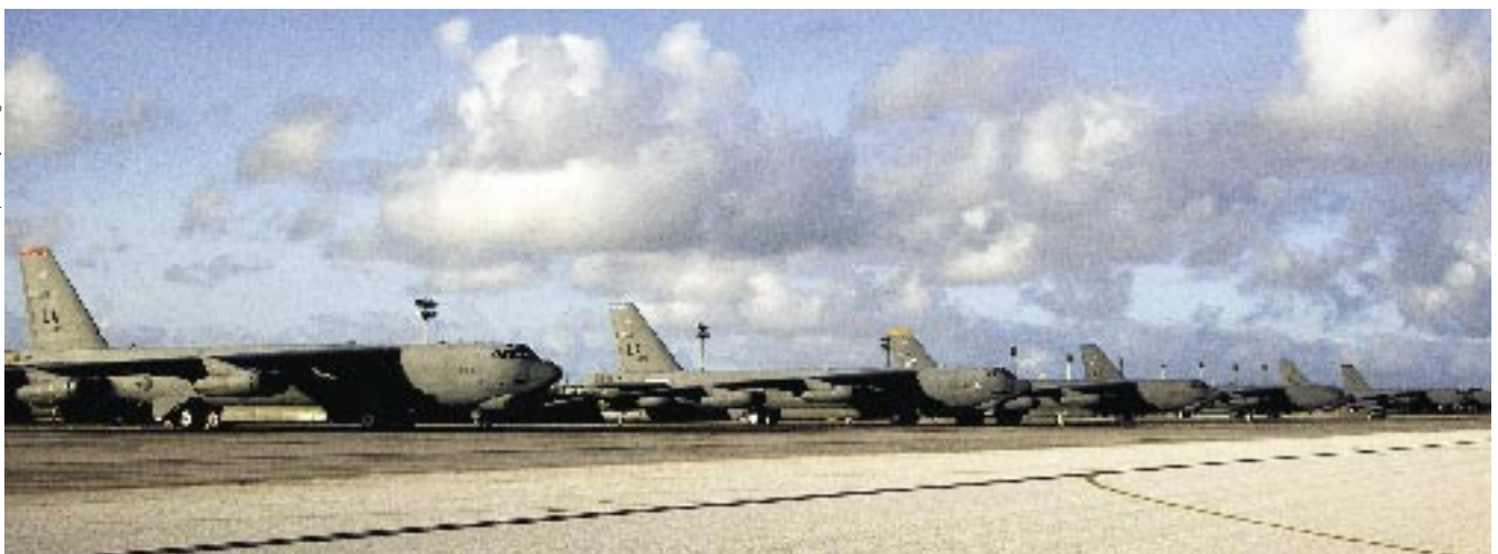
B-52s from Barksdale AFB, La., and Minot AFB, N.D., wait on the flight line at Andersen AFB, Guam, in preparation for their next mission.